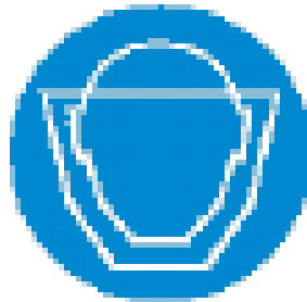
Protezione obbligatoria del viso