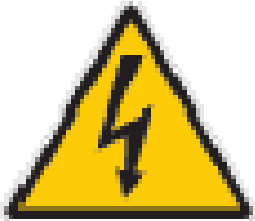
Tensione elettrica pericolosa