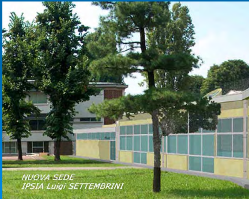
NUOVA SEDE IPSTA Luigi SETTEMBRINI